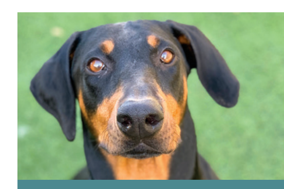
ON THE COVER Learn how changes during the pandemic have helped more animals with special needs, like Coco! Pages 5-6